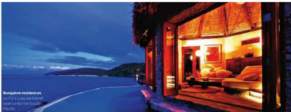
Bungalow residences on Fiji's Luvu Island open onto the South Pacific.