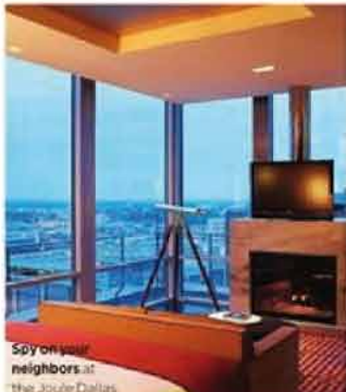
Spy on your neighbors at The Joule Dallas.