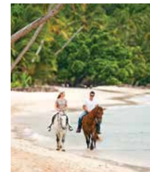
Ride to secluded beaches on a horseback tour, stopping for a romantic picnic along the way.